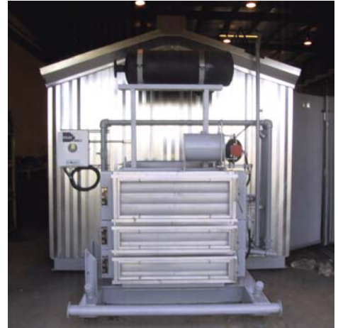
Continental TM27 Engine Driving a Blackmer HDS612 Sour Gas Compressor C/W Exernal Cooler